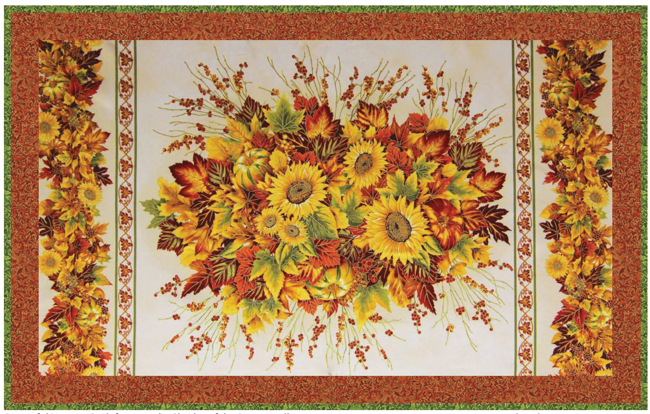
Bountiful Harvest Quilt features the Shades of the Season collection by Robert Kaufman Fabrics.