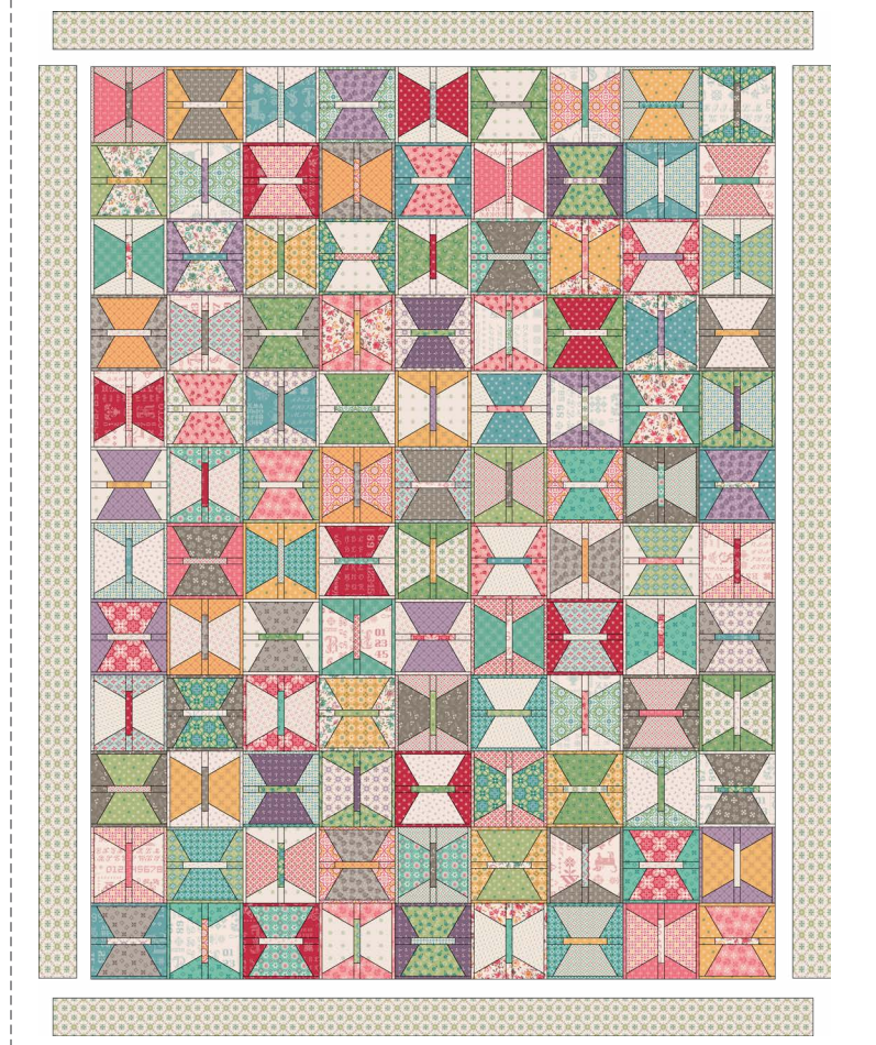
60 ½" × 78 ½"