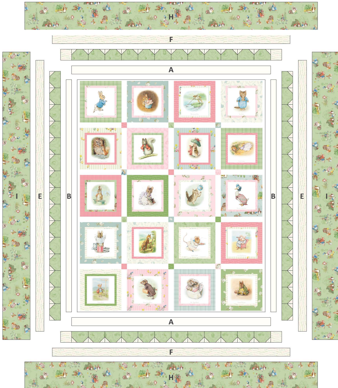
QUILT LAYOUT DIAGRAM