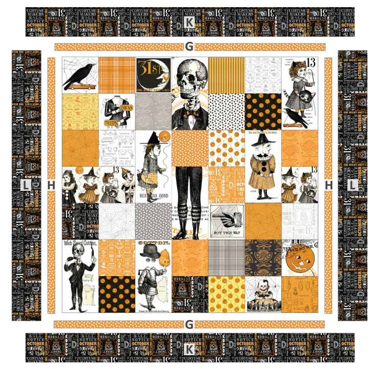
68" × 68"