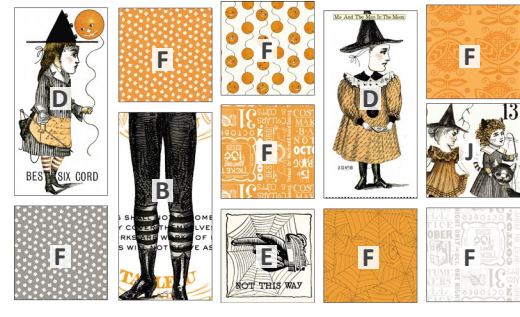
23" × 38"

3. Arrange (1) B -rectangle, (2) D -rectangles, (1) E -square, (7) F -squares, and (1) J -square as shown below. Sew the rectangles and squares together into columns. Next, sew the columns together to make the Quilt Center 3 Unit.