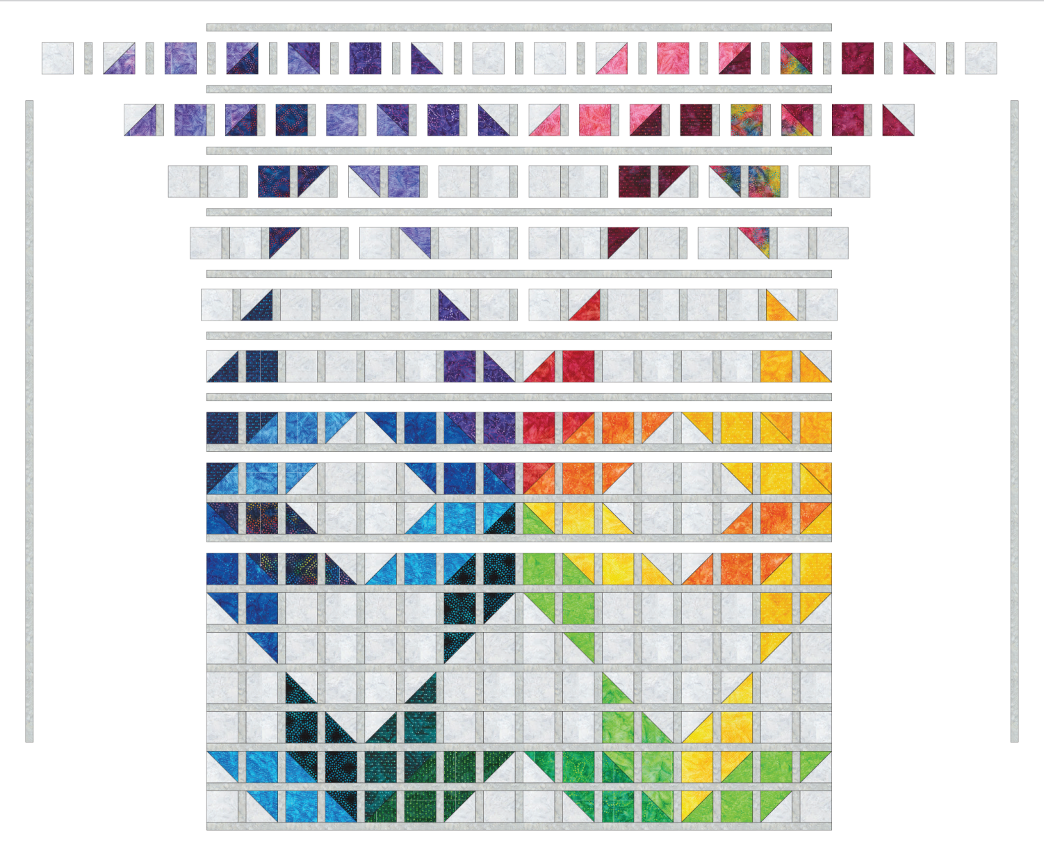
Step 4: Arrange the HSTs and 4-1/2" squares together as indicated in the Quilt Assembly Diagram. Sew each row together, using sashing strips between each block. Press seams toward the sashing. Repeat to make sixteen block rows. Note: Pay close attention to the fabric placement and HST orientation.

Step 5: Sew the row sashing and block rows together, placing a row sashing strip between each row and at the top and bottom of the quilt. Press seams open or to the sashing.