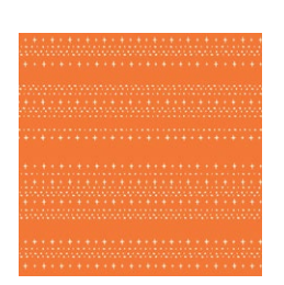
SNS-13001 STARS ALIGNED TRICK