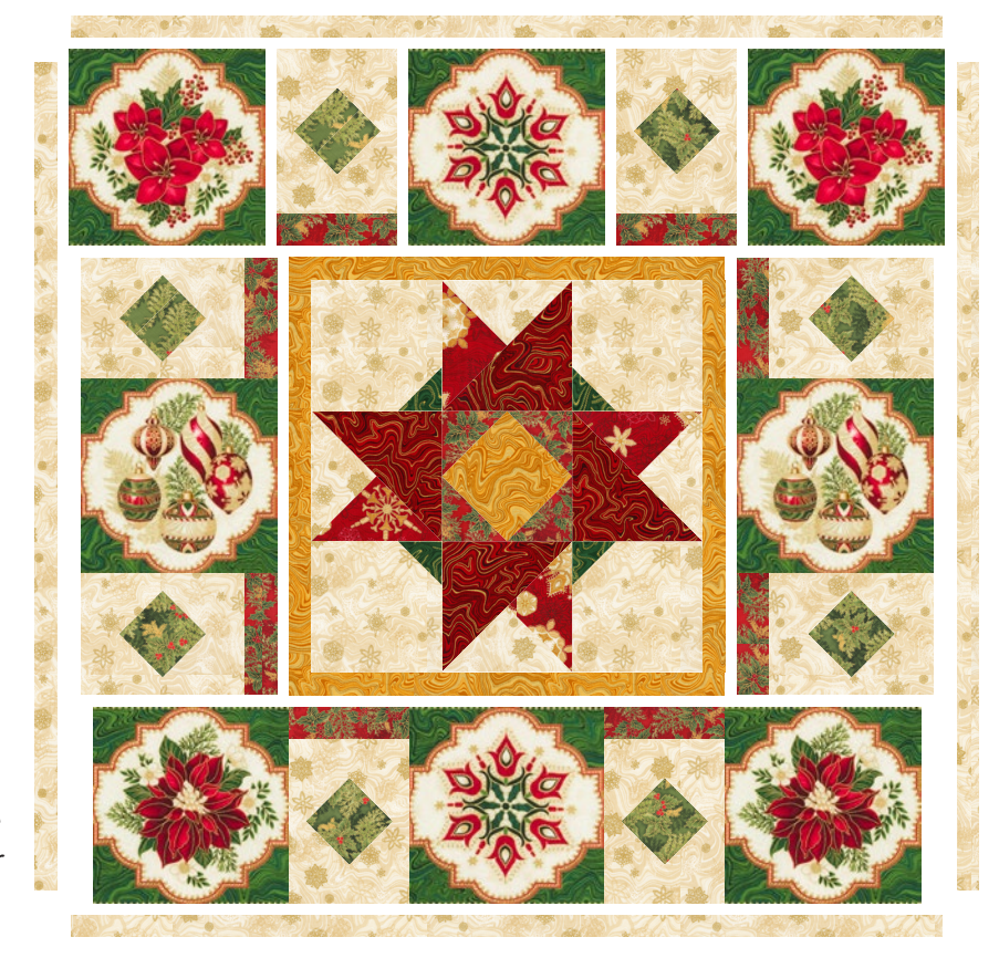
Step 11: Sew 1-1/2" x 38-1/2" Fabric B strips to the sides of the Quilt Center. Press. Sew 1-1/2" x 40-1/2" Fabric B strips to the top and bottom of the Quilt Center. Press.

Step 10: Sew the top and bottom rows together, as shown. Press. Sew to the top and bottom edges of the Center Block. Press. The Quilt Center should measure 38-1/2" square at this point.