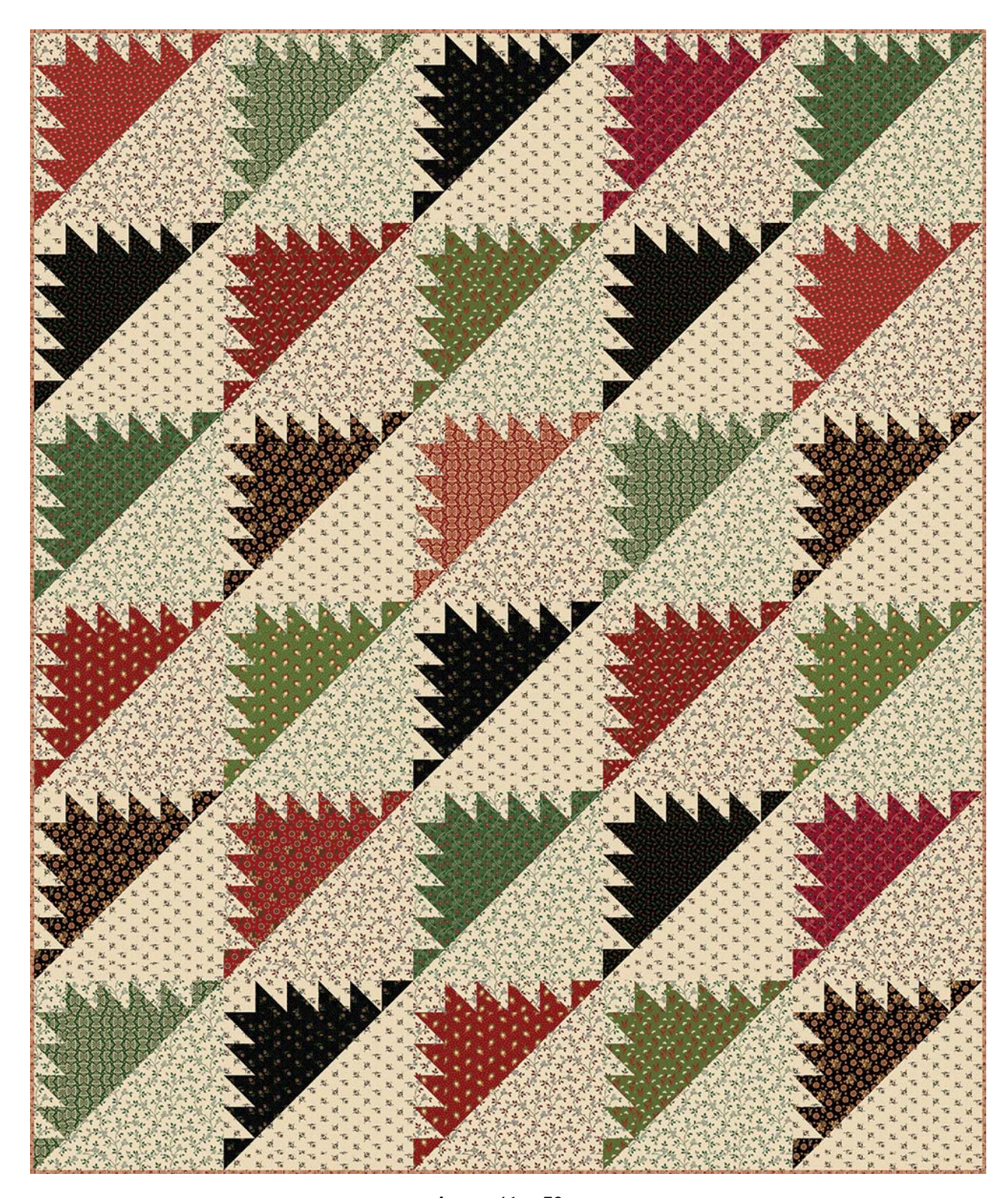
Approx 61" x 78"