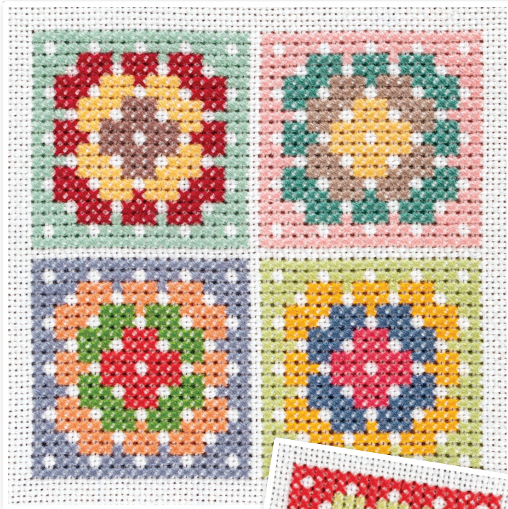
Large Granny Square