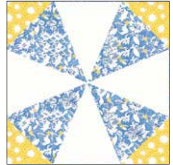
Yellow Corner on Fabric Triangle